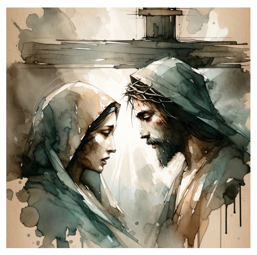
READ - JOHN 19:25-27 The mystery of love