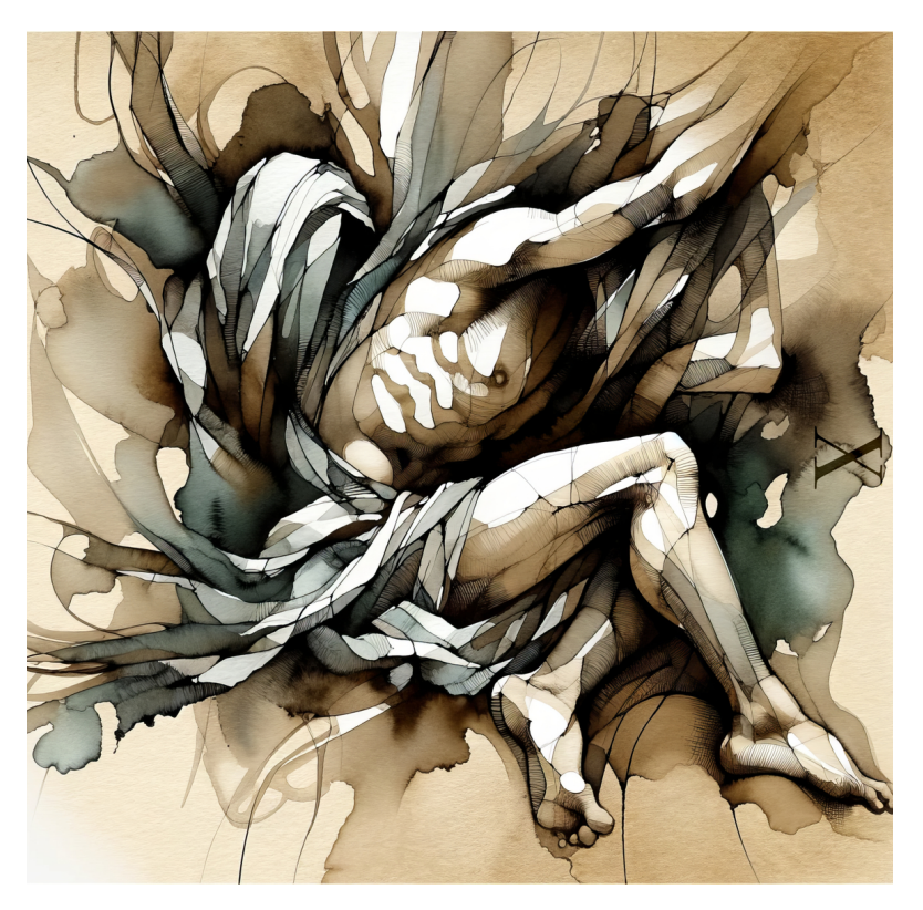
READ - JOHN 19:23-24 When we fail to honor