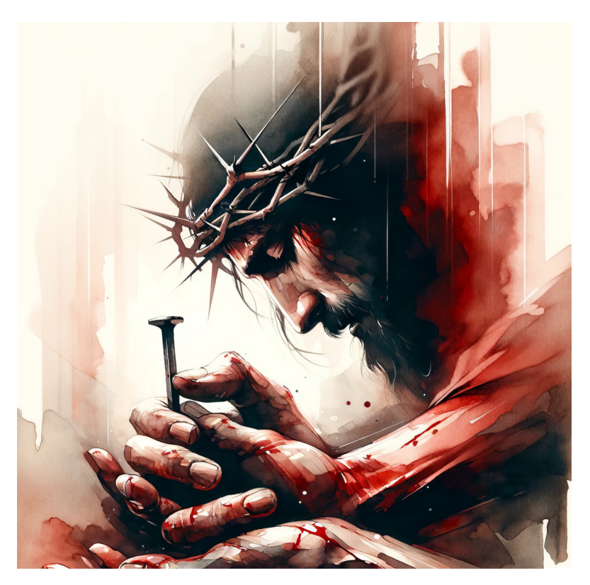
READ - MARK 15:23-32 The impact of the cross