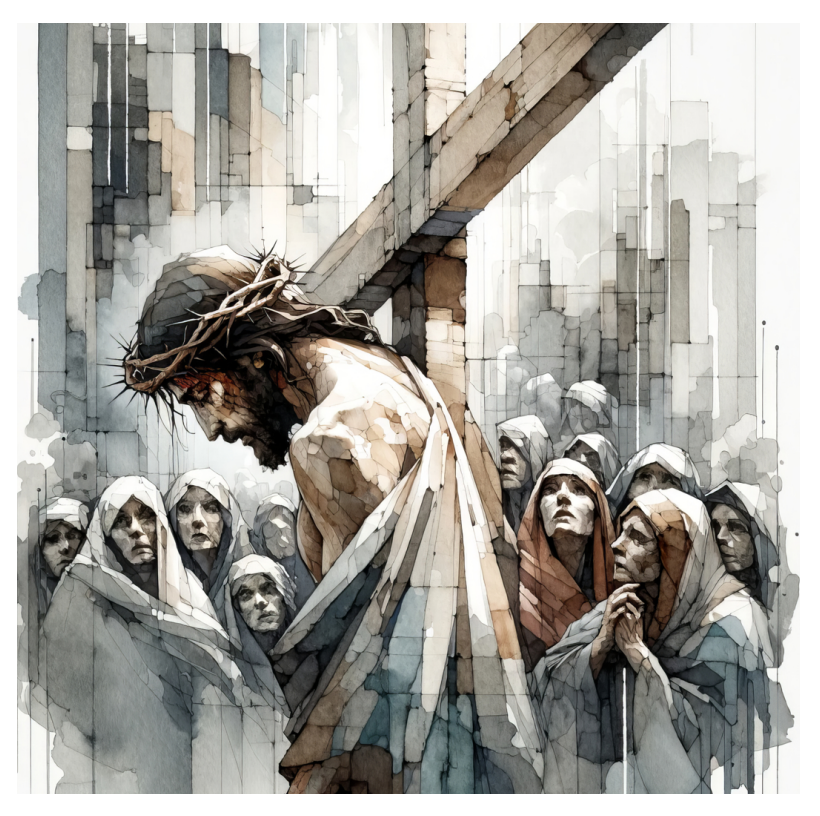
READ - LUKE 23:27-31 A caution against a lack of true repentance